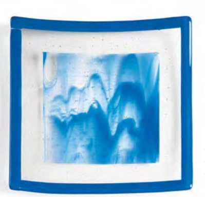
Figure 7: This plate (shown still on the mold) was formed with two separate firings. The first was a full fuse and the second was a slump firing.

Full fusing temperatures are much higher than slumping temperatures. If you attempt to fuse and slump in one step by firing to full fuse temperatures, the result will be an extremely misshapen piece of glass that is likely to have some large bubbles or craters and may be stuck to the mold (see Figure 7 and 8).