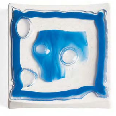
Figure 8: This plate (shown still on the mold) was formed with a single firing for both fusing and slumping. This shortcut caused edge distortion and bubbles.