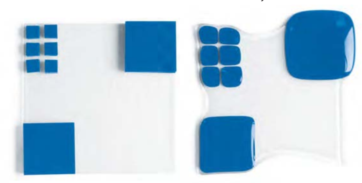
Figure 4; Stacking glass unevenly and close to edges can result in distortion of the shape of the fired glass.

Once you have a 6 mm base, use small pieces of thin cut glass, frit, powder, or stringer to create your design. Keep any heavy applications away from the edge. Piling too much glass at the perimeter will cause the glass to flow out and distort the footprint of your finished plate form at the edge, and may also result in the formation of bubbles between the base layers (see Figure 4). (See also TechNote 5: Volume and Bubble Control.)