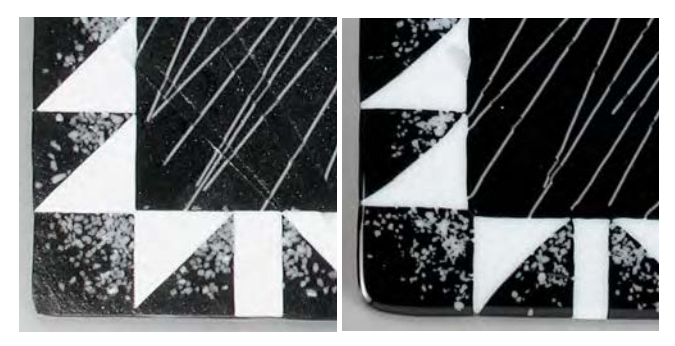
Figure 5: The design on the left was fired face down, The design on the right was fired face up. Notice the crisp edges of the design on the left.

For the cleanest butt-jointed seams, build your design (of tightly composed pieces) directly onto the shelf or shelf paper and cover with an uncut layer of glass (see Figure 5). The top layer will hold the seams together during firing and leave a virtually invisible seam and crisper lines between colors. The same design laid up on top of the piece will result in softer lines between colors and seams that have pulled apart to reveal the color of the base glass.