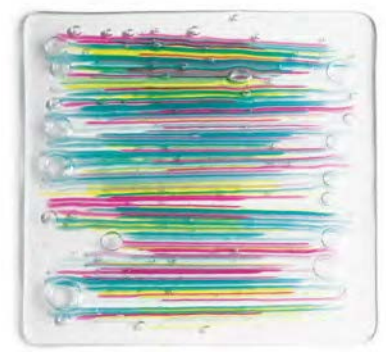
Figure 6: In firing, the edges of this tile sealed, preventing the escape of air bubbles trapped between stringers.

Avoid putting elements of frit, stringer or cut pieces of sheet between two solid layers of glass. Doing so will trap air and result in large bubbles (see Figure 6). Instead, place design elements on the top layer of the plate. Or pre-fire them to a sheet glass base, then layer the relatively smooth sheet into your plate. (To learn more, see Make It Project: Opaline Sushi Set at bullseyeglass.com).