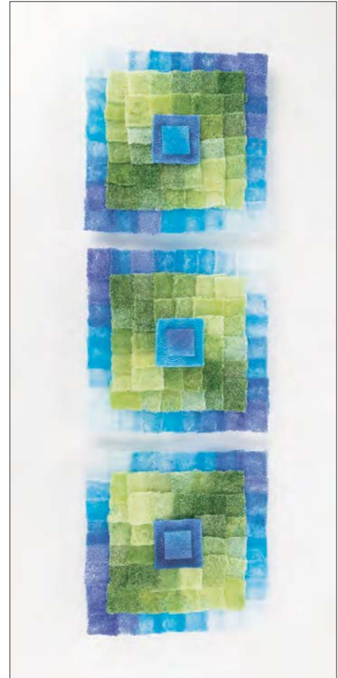
Susan Longini, Pieced Quilt Triptych , 2005. Pâte de verre, 36 x 11 x 2 in (91 x 28 x 5 cm) installed.

Longini fired her tinted components to a low temperature, retaining a delicate, granular appearance.