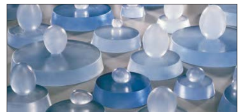
Steven Easton, Snow Queen's Realm II (detail), 2005. Pâte de verre, 5 x 36 x 84 in (13 x 91 x 213 cm) installed.

Longini fired her tinted components to a low temperature, retaining a delicate, granular appearance.