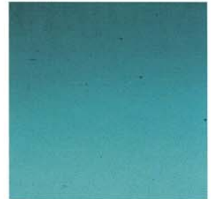
1408 LT. AQUAMARINE BLUE