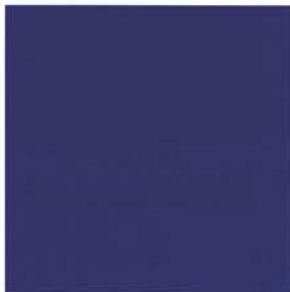
0114 COBALT BLUE