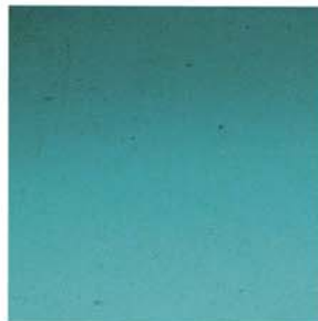
1408 LT. AQUAMARINE BLUE