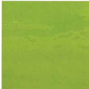
0126 SPRING GREEN